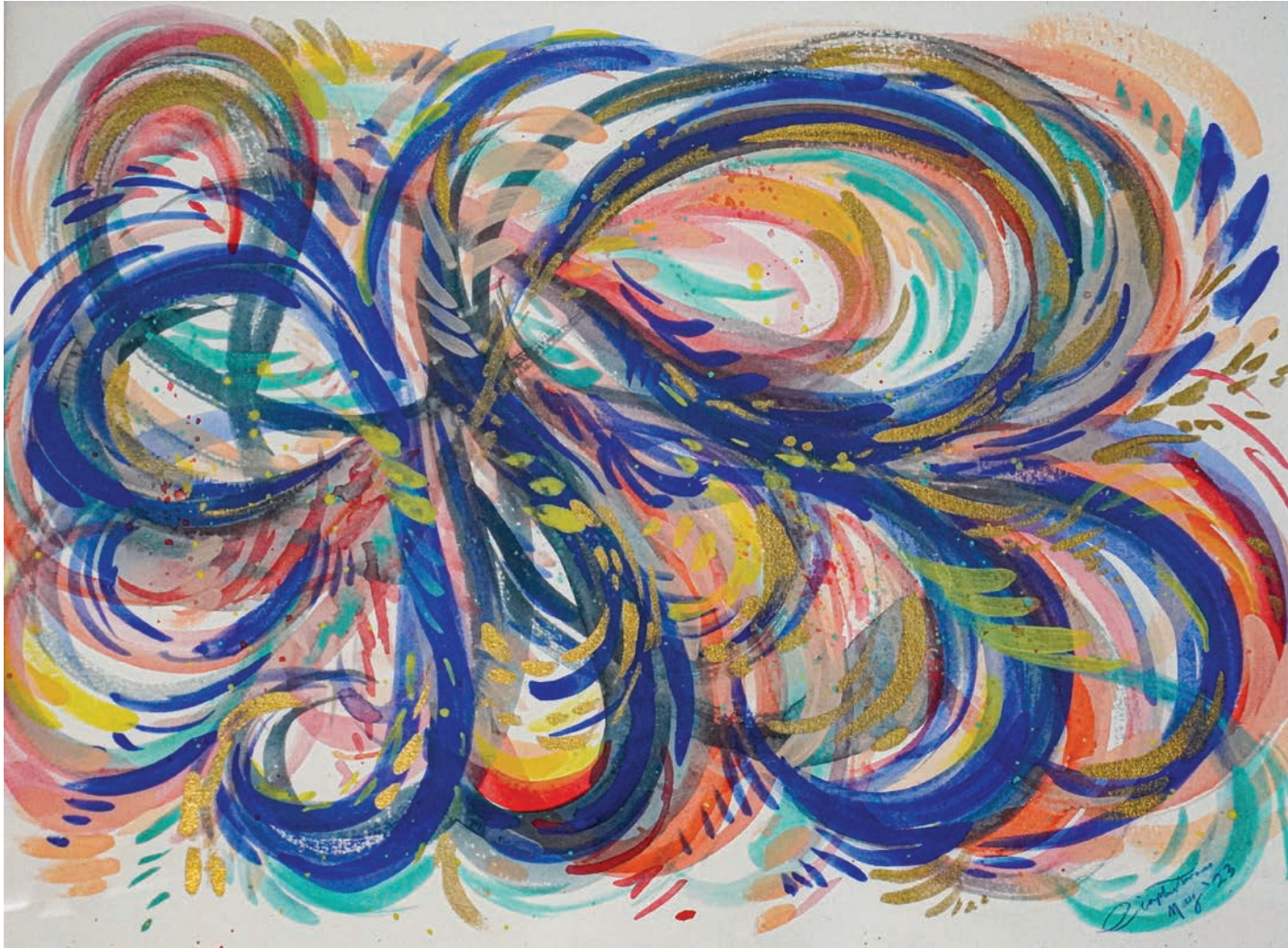
AFC 05: Motion Series - Dance

Medium Gouache and Watercolour Size 29.7 x 42 cm Year 2023