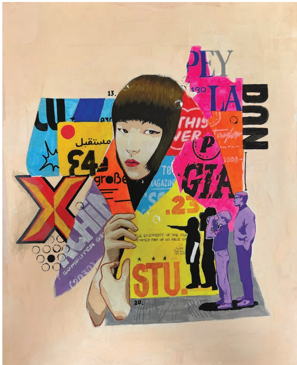
AFC 22: Unknown #2

Medium Oil painting on canvas Size 50 x 40 cm Year 2023